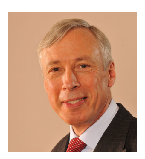
Rt Hon Earl Howe, Parliamentary Under Secretary for Quality, Department of Health